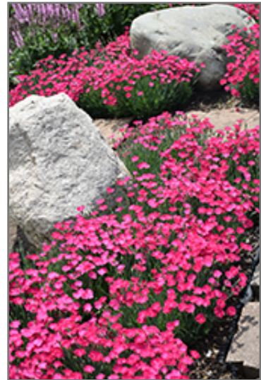
Paint The Town Magenta Dianthus in bloom

Paint The Town Magenta Dianthus is an herbaceous evergreen perennial with a mounded form. It brings an extremely fine and delicate texture to the garden composition and should be used to full effect.