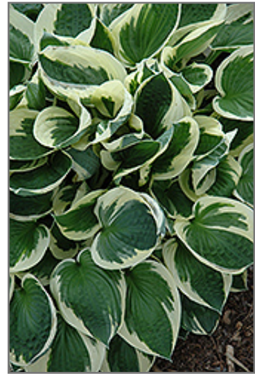
Patriot Hosta foliage