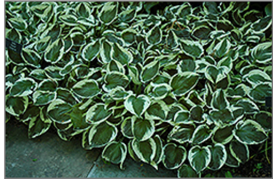
Patriot Hosta

This plant does best in partial shade to shade. It prefers to grow in average to moist conditions, and shouldn't be allowed to dry out. It is not particular as to soil type or pH. It is somewhat tolerant of urban pollution. This particular variety is an interspecific hybrid. It can be propagated by division; however, as a cultivated variety, be aware that it may be subject to certain restrictions or prohibitions on propagation.