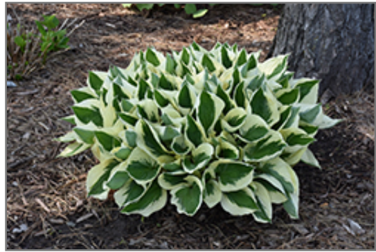
Patriot Hosta