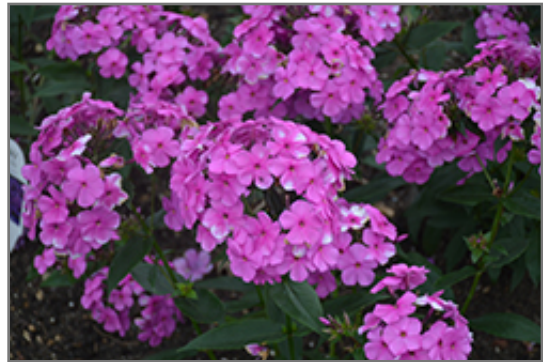
Cloudburst Phlox flowers