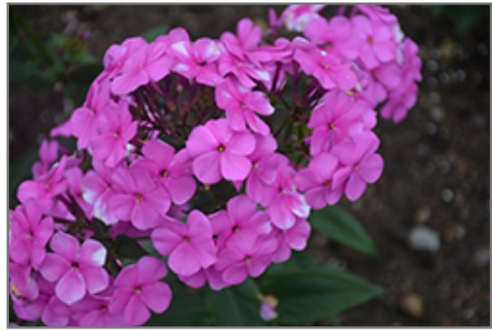
Cloudburst Phlox flowers

Cloudburst Phlox is recommended for the following landscape applications;