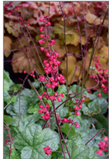
Dolce Spearmint Coral Bells flowers

Dolce Spearmint Coral Bells is recommended for the following landscape applications;