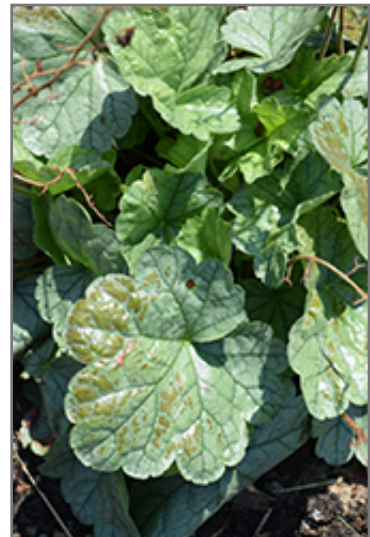
Dolce Spearmint Coral Bells foliage