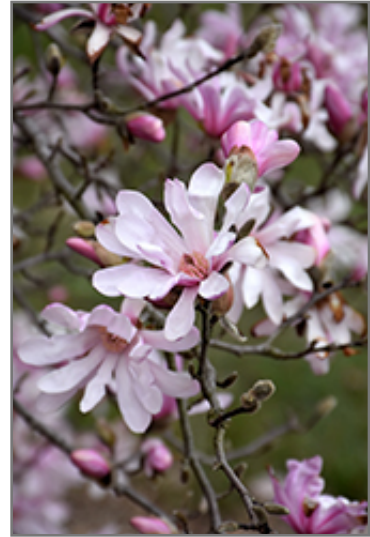
Leonard Messel Magnolia flowers