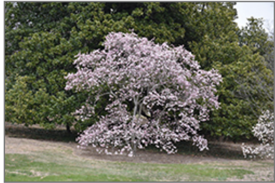
Leonard Messel Magnolia in bloom