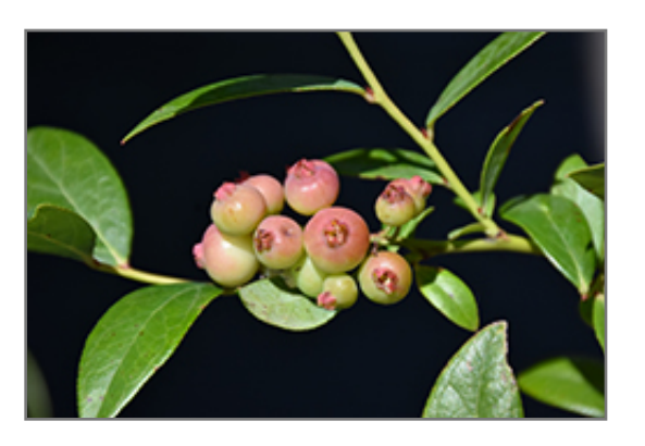
Pink Lemonade Blueberry fruit