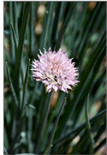
Pink Giant Allium flowers

This is a large flowered variety of common chives; mound of grassy powder blue foliage with big pink balls of color rising above in late spring; flowers and leaves are edible; great in containers or along borders