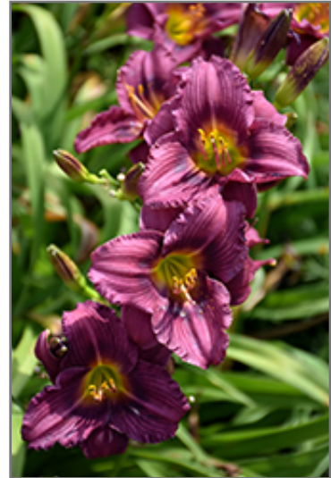
Little Grapette Daylily flowers