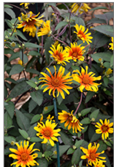
Burning Hearts False Sunflower flowers