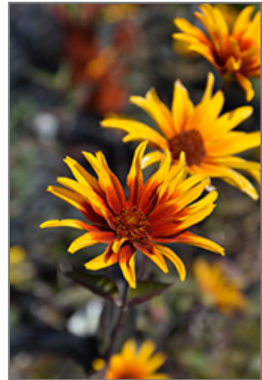
Burning Hearts False Sunflower flowers

Burning Hearts False Sunflower is recommended for the following landscape applications;