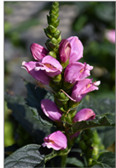
Tiny Tortuga Turtlehead flowers