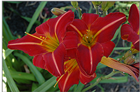
Chicago Fire Daylily flowers