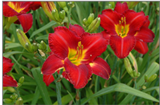
Chicago Apache Daylily flowers

Rich scarlet red flowers with slightly ruffled edges bloom during the mid summer months; tall flower stalks rise above mounds of green arching foliage; an elegant addition to borders, beds and containers; low maintenance and drought tolerant