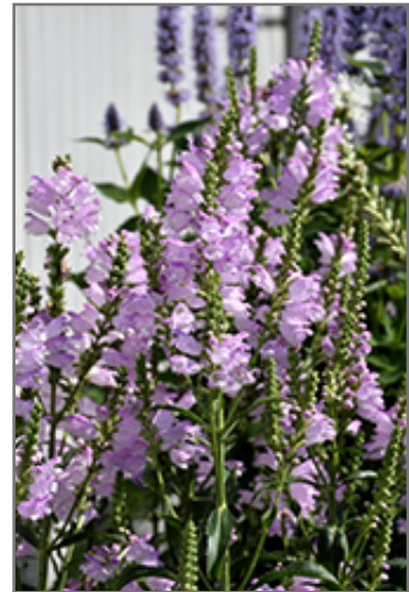
Pink Manners Obedient Plant flowers