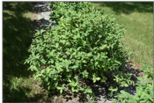
Aurora Honeyberry