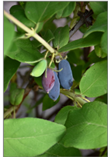
Aurora Honeyberry fruit

Aurora Honeyberry features subtle yellow flowers along the branches in early spring. It has green deciduous foliage. The narrow leaves do not develop any appreciable fall color. It features an abundance of magnificent blue berries in late spring.