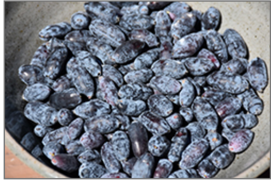
Aurora Honeyberry fruit

This shrub is quite ornamental as well as edible, and is as much at home in a landscape or flower garden as it is in a designated edibles garden. It does best in full sun to partial shade. It prefers dry to average moisture levels with very well-drained soil, and will often die in standing water. It is not particular as to soil type or pH. It is highly tolerant of urban pollution and will even thrive in inner city environments. This is a selected variety of a species not originally from North America.