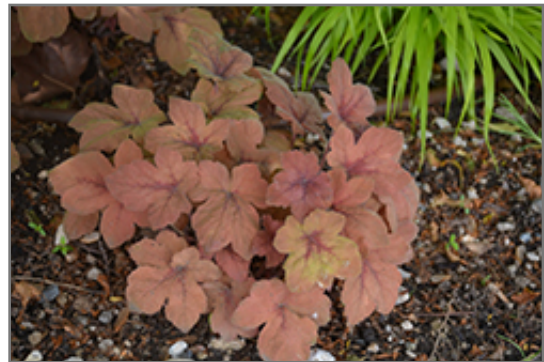
Pumpkin Spice Foamy Bells