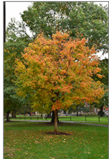
Three Flowered Maple in fall