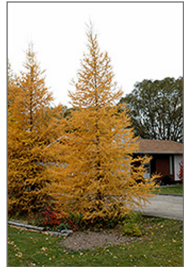
American Larch in fall

American Larch is recommended for the following landscape applications;