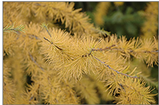
American Larch in fall