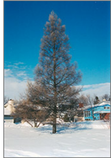
American Larch in winter

This tree does best in full sun to partial shade. It is quite adaptable, preferring to grow in average to wet conditions, and will even tolerate some standing water. It is not particular as to soil type, but has a definite preference for acidic soils. It is quite intolerant of urban pollution, therefore inner city or urban streetside plantings are best avoided. This species is native to parts of North America.