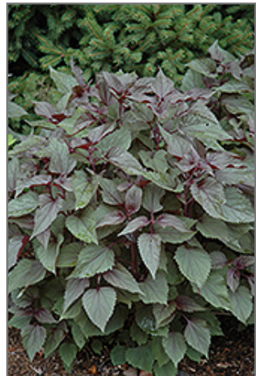
Chocolate Joe-Pye Weed foliage