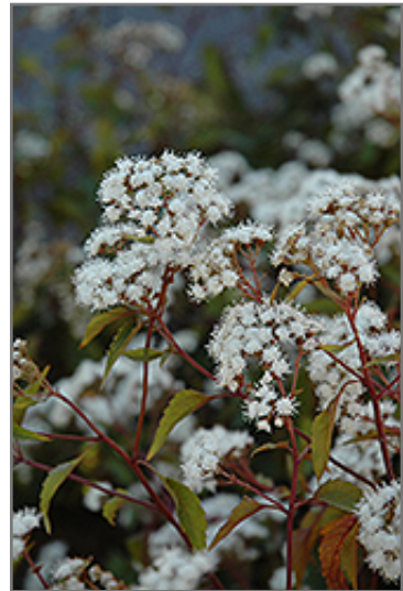
Chocolate Joe-Pye Weed flowers