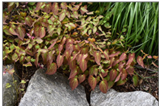
Red Barrenwort (Bishop's Hat)