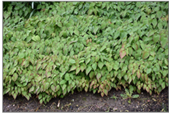
Red Barrenwort (Bishop's Hat)