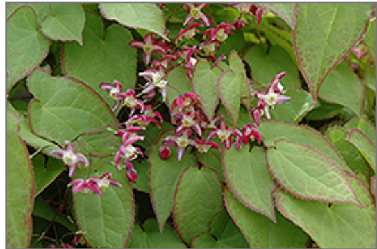
Red Barrenwort (Bishop's Hat) flowers

Red Barrenwort (Bishop's Hat) is a dense herbaceous evergreen perennial with a ground-hugging habit of growth. Its relatively fine texture sets it apart from other garden plants with less refined foliage.