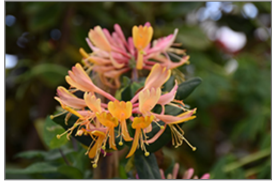
Goldflame Honeysuckle flowers