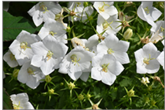
White Clips Bellflower flowers