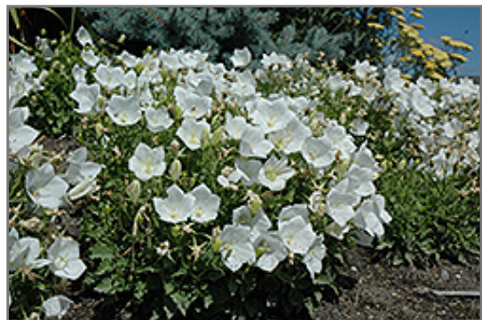
White Clips Bellflower flowers