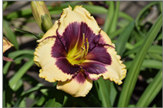
Blackthorne Daylily flowers