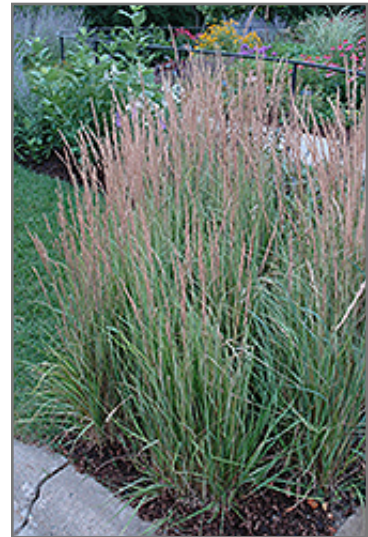
Overdam Feather Reed Grass in bloom

Overdam Feather Reed Grass is recommended for the following landscape applications;