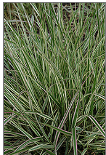
Overdam Feather Reed Grass foliage