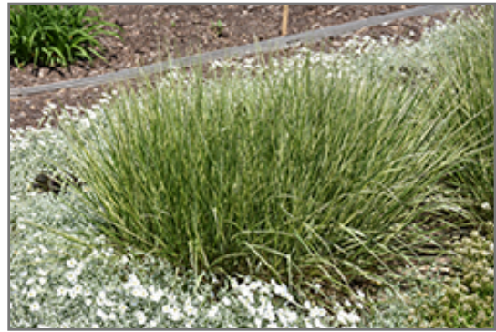
Overdam Feather Reed Grass

Overdam Feather Reed Grass will grow to be about 30 inches tall at maturity, with a spread of 24 inches. It tends to be leggy, with a typical clearance of 1 foot from the ground, and should be underplanted with lower-growing perennials. It grows at a medium rate, and under ideal conditions can be expected to live for approximately 10 years. As an herbaceous perennial, this plant will usually die back to the crown each winter, and will regrow from the base each spring. Be careful not to disturb the crown in late winter when it may not be readily seen!