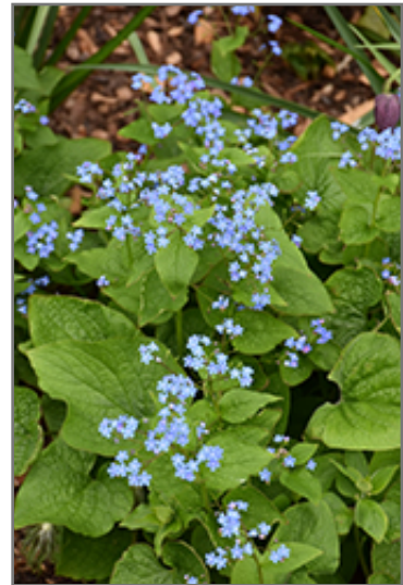
Siberian Bugloss flowers