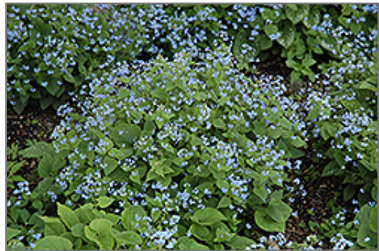
Siberian Bugloss in bloom