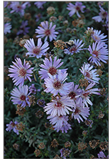
Woods Blue Aster flowers

Mounds of narrow, dark green foliage are covered with sky-blue daisy-like flowers, adding a pop of color to autumn days; dwarf compact habit, ideal for patio containers, borders or garden beds; beautiful added to fresh cut arrangements; low maintenance