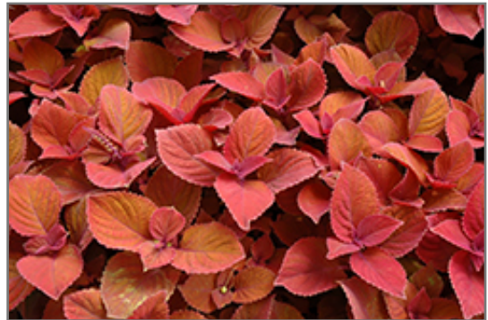
Campfire Coleus foliage