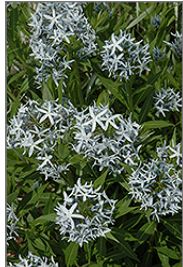
Blue Star Amsonia flowers