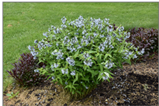
Blue Star Amsonia in bloom