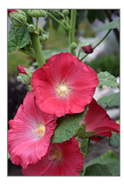
Hollyhock flowers

A beautiful towering variety that features large, brightly colored blooms throughout the summer months; a low maintenance selection perfect for garden beds, containers, or used for screening and in fresh cut arrangements