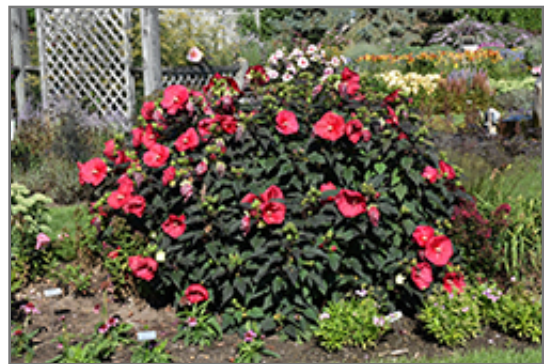
Mars Madness Hibiscus in bloom