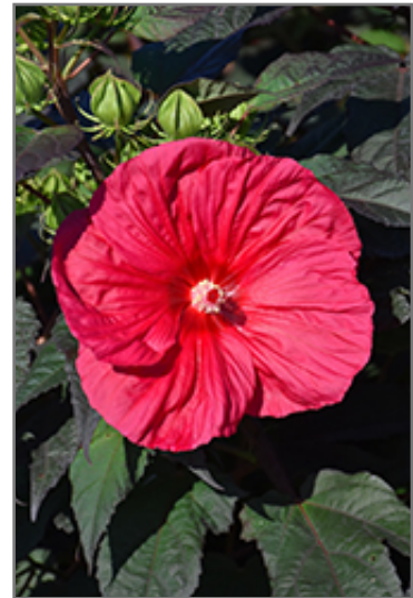
Mars Madness Hibiscus flowers