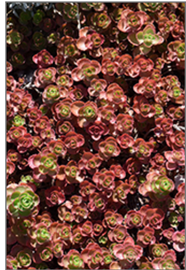
Dragon's Blood Sedum in fall

This plant will require occasional maintenance and upkeep, and is best cleaned up in early spring before it resumes active growth for the season. Deer don't particularly care for this plant and will usually leave it alone in favor of tastier treats. Gardeners should be aware of the following characteristic(s) that may warrant special consideration;