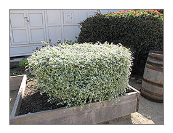
Licorice Plant