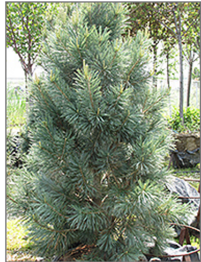
Vanderwolf's Pyramid Pine