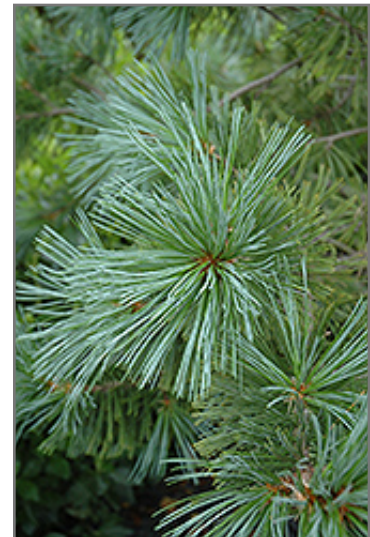
Vanderwolf's Pyramid Pine foliage