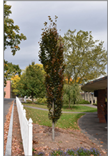
Dawyck Purple Beech