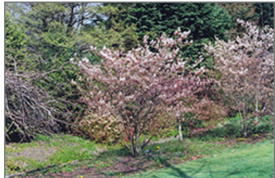
Cole's Select Serviceberry in bloom