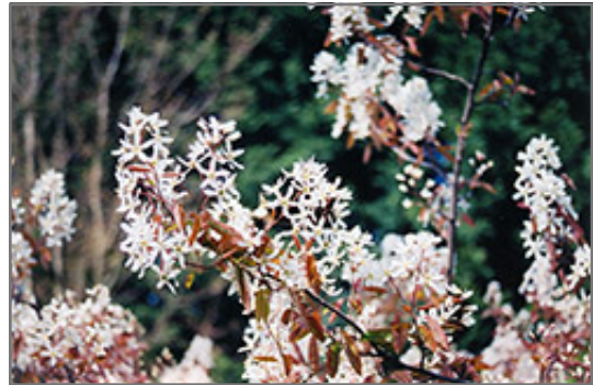
Cole's Select Serviceberry flowers