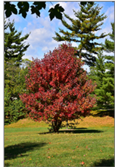
Redpointe Red Maple in fall

This tree should only be grown in full sunlight. It is quite adaptable, preferring to grow in average to wet conditions, and will even tolerate some standing water. It is not particular as to soil type, but has a definite preference for acidic soils, and is subject to chlorosis (yellowing) of the foliage in alkaline soils. It is somewhat tolerant of urban pollution. This is a selection of a native North American species.