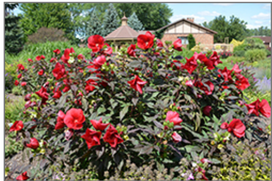
Midnight Marvel Hibiscus in bloom