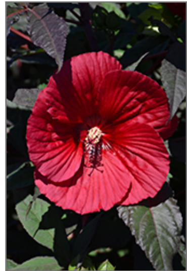
Midnight Marvel Hibiscus flowers