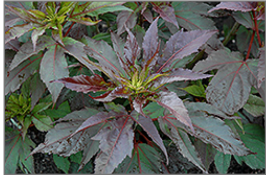
Midnight Marvel Hibiscus foliage

Midnight Marvel Hibiscus will grow to be about 4 feet tall at maturity, with a spread of 4 feet. It grows at a fast rate, and under ideal conditions can be expected to live for approximately 5 years. As an herbaceous perennial, this plant will usually die back to the crown each winter, and will regrow from the base each spring. Be careful not to disturb the crown in late winter when it may not be readily seen!