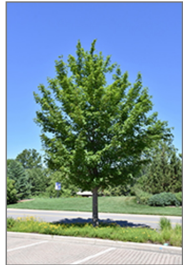
State Street Miyabe Maple

State Street Miyabe Maple will grow to be about 40 feet tall at maturity, with a spread of 40 feet. It has a high canopy with a typical clearance of 5 feet from the ground, and should not be planted underneath power lines. It grows at a fast rate, and under ideal conditions can be expected to live for 80 years or more.