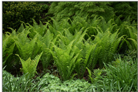
Ostrich Fern