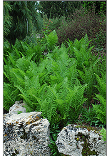
Ostrich Fern

Ostrich Fern is recommended for the following landscape applications;