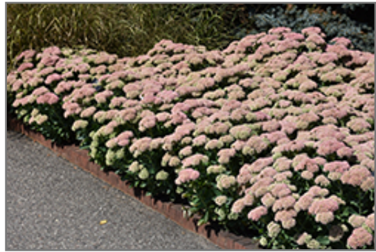
Autumn Joy Sedum in bloom

Autumn Joy Sedum is recommended for the following landscape applications;