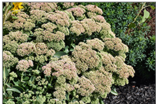
Autumn Joy Sedum in bloom