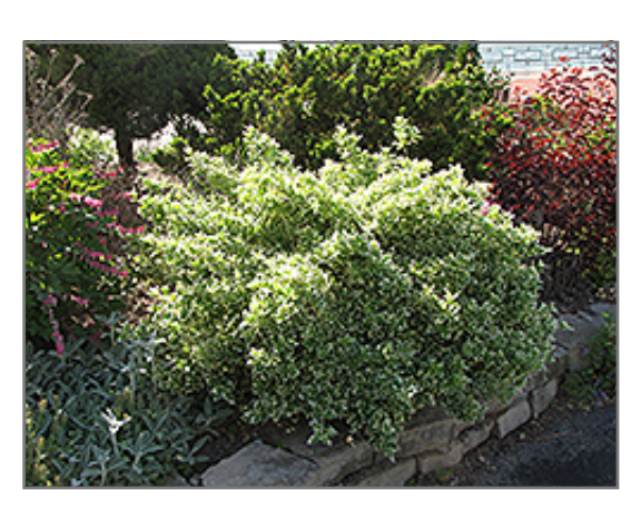
Emerald Gaiety Wintercreeper