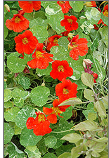
Alaska Nasturtium flowers