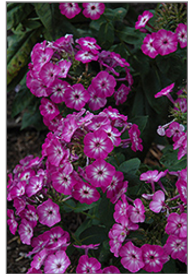
Purple Eye Flame Garden Phlox flowers