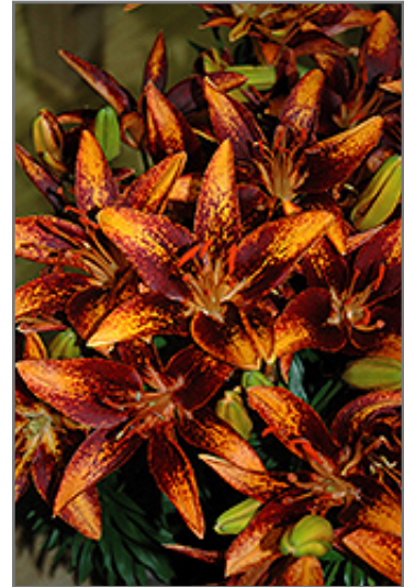
Tiny Orange Sensation Lily flowers