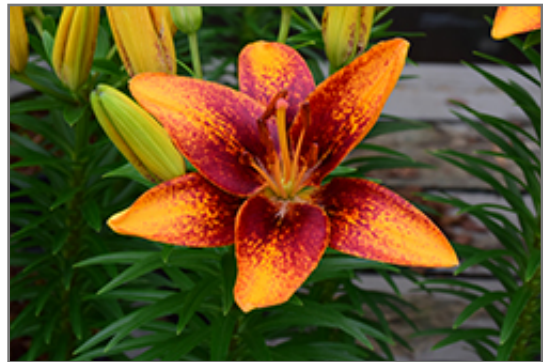
Tiny Orange Sensation Lily flowers