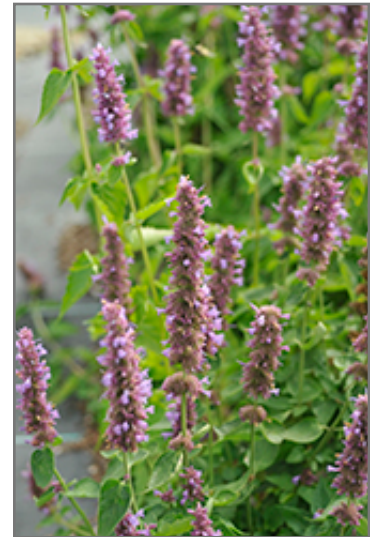
Blue Boa Hyssop flowers

Blue Boa Hyssop is recommended for the following landscape applications;