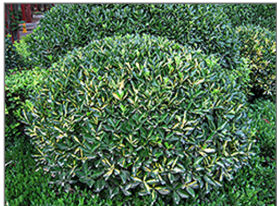
Moonshadow Wintercreeper