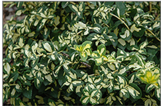
Moonshadow Wintercreeper foliage