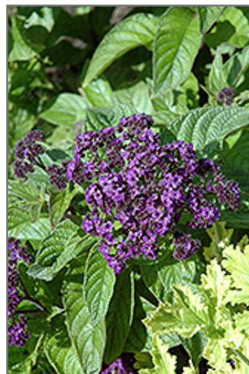
Marine Heliotrope flowers

Beautifully scented, deep purple flower clusters are featured on upright mounded dark green foliage; a heat tolerant variety, excellent in borders, patio containers and hanging baskets; deadhead to encourage new growth throughout the season