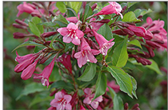
Rumba Weigela flowers