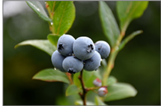
Northsky Blueberry fruit

Northsky Blueberry features dainty clusters of white bell-shaped flowers with shell pink overtones hanging below the branches in mid spring. It has green deciduous foliage. The glossy oval leaves turn an outstanding scarlet in the fall. It features an abundance of magnificent blue berries in mid summer.