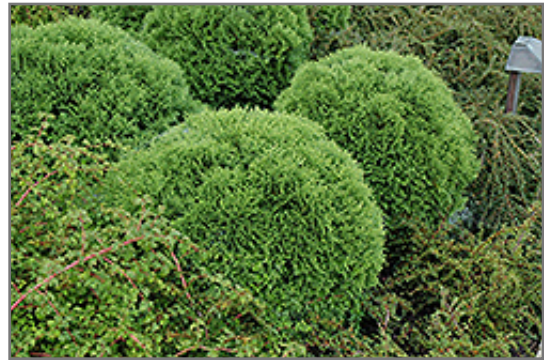
Little Giant Arborvitae

Little Giant Arborvitae will grow to be about 3 feet tall at maturity, with a spread of 4 feet. It tends to fill out right to the ground and therefore doesn't necessarily require facer plants in front. It grows at a slow rate, and under ideal conditions can be expected to live for approximately 30 years.