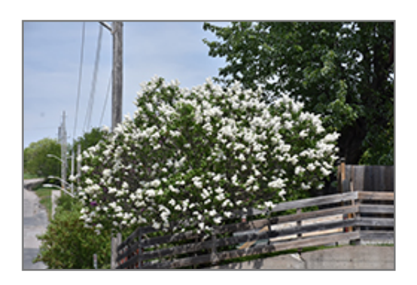
White French Lilac in bloom