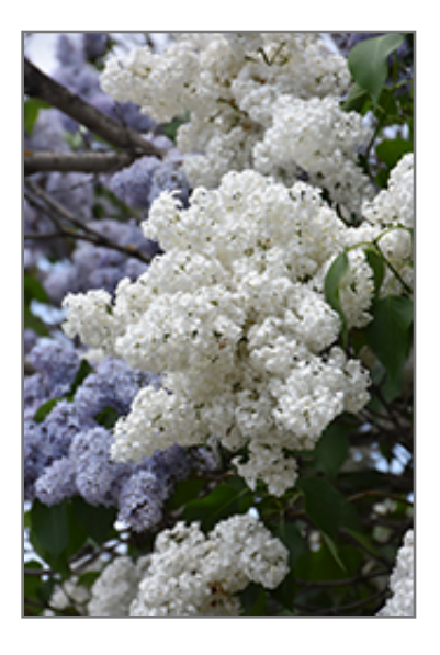
White French Lilac flowers

This is a high maintenance shrub that will require regular care and upkeep, and should only be pruned after flowering to avoid removing any of the current season's flowers. It is a good choice for attracting butterflies to your yard, but is not particularly attractive to deer who tend to leave it alone in favor of tastier treats. Gardeners should be aware of the following characteristic(s) that may warrant special consideration;